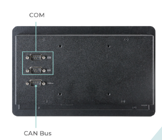
■ Back View